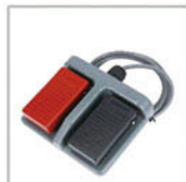
Foot Switch Adjust front window height by foot during experiment, to avoid airflow turbulence caused by arm movement.