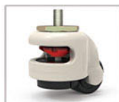
Footmaster Caster Universal caster with brake and leveling feet.