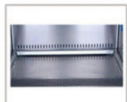
Work Zone Work zone, made of 304 stainless steel, is surrounded by negative pressure.