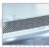
Anti-paper dust structure