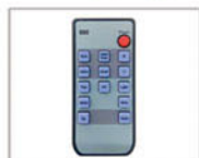
Remote Control All functions can be realized with it, making the operation much easier and more convenient.