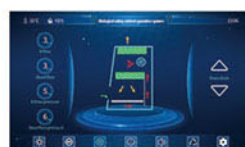
LCD Display 7 Inch touch screen display is easy to monitor all the safety parameters at a glance and ergonomically sized control panel improves user interface.