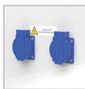
Waterproof Socket 2 waterproof sockets are located in the side wall, for optimum convenience of using small devices inside the cabinet.