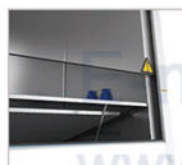
Worktop Holder Usage Diagram